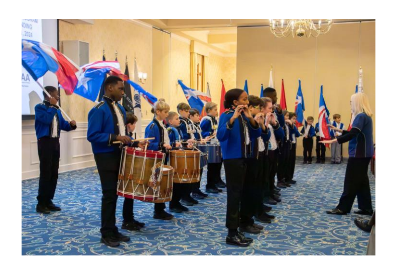
Linton Hall Fife and Drum Corps