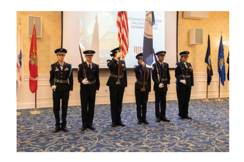
Chantilly AFJROTC Color Guard